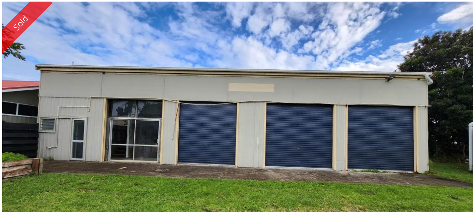
5 Grassy Rd, Norfolk Island