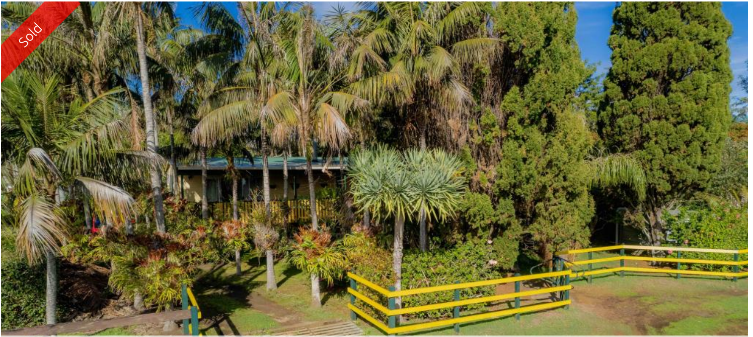
14 Shortridge Road, Norfolk Island