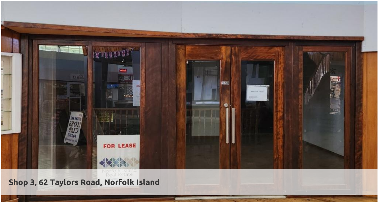
Shop 3, 62 Taylors Road, Norfolk Island