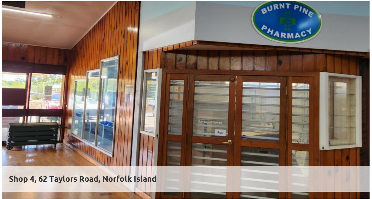
Shop 4, 62 Taylors Road, Norfolk Island