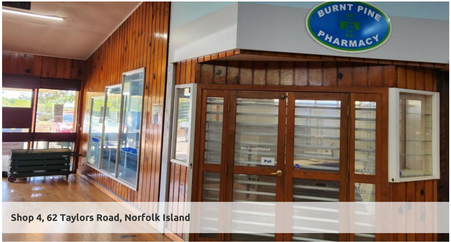
Shop 4, 62 Taylors Road, Norfolk Island