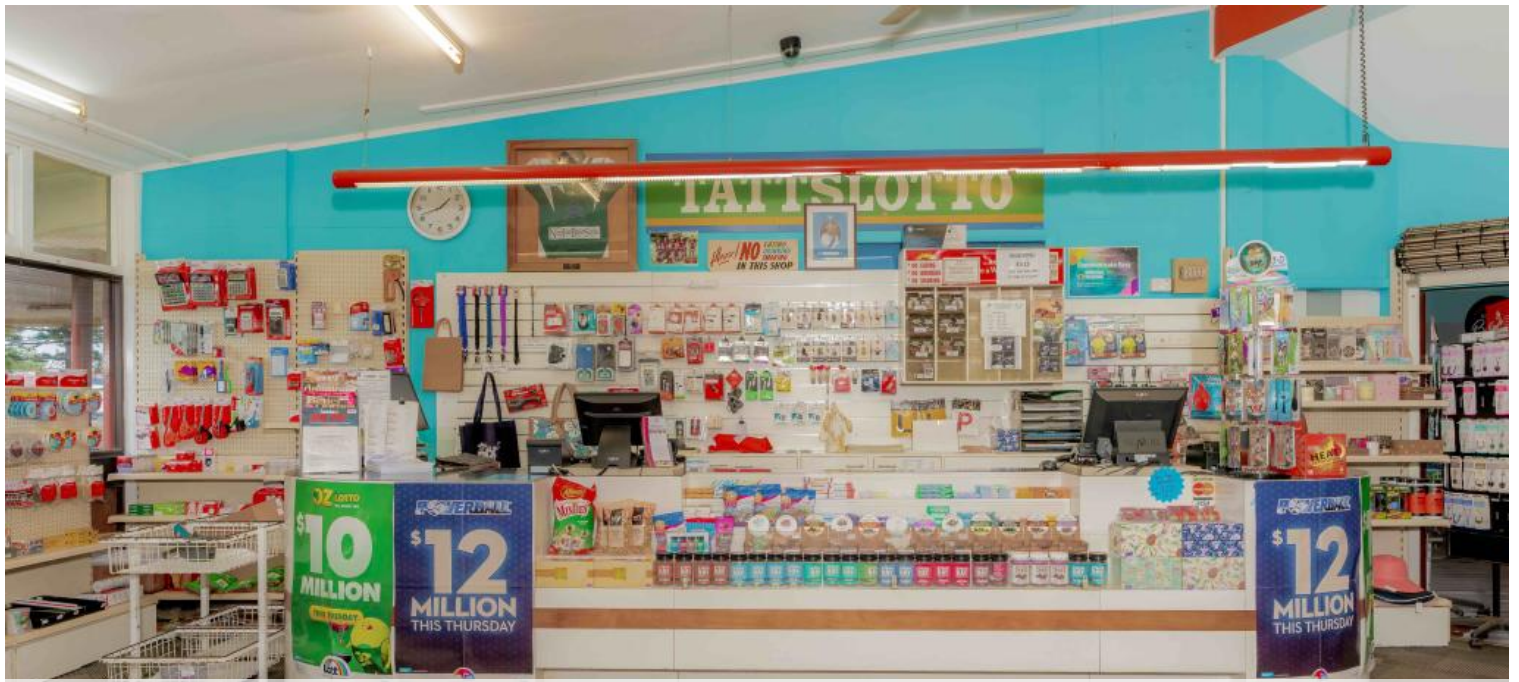
62 Taylors Road, Norfolk Island