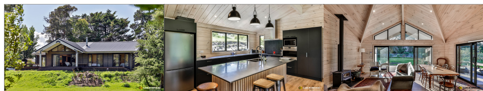
The intersecting gable rooflines create an impressive ceiling inside the home,

The PEKAPEKA HOUSE is a three-bedroom, 152m 2 home designed for comfortable family living or as a relaxed family holiday home. The open plan kitchen, living and dining area, two of the three bedrooms, and the snug all open out onto a large deck with built-in seating, while the third bedroom also has separate access to the outdoors.