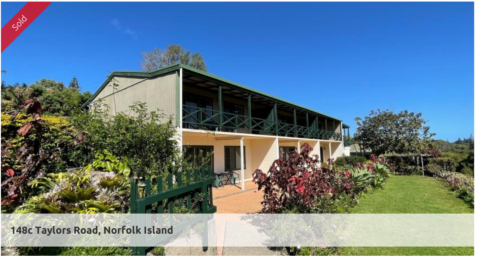
148c Taylors Road, Norfolk Island