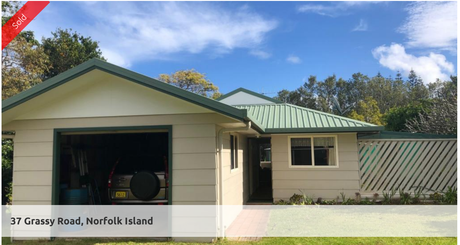
37 Grassy Road, Norfolk Island