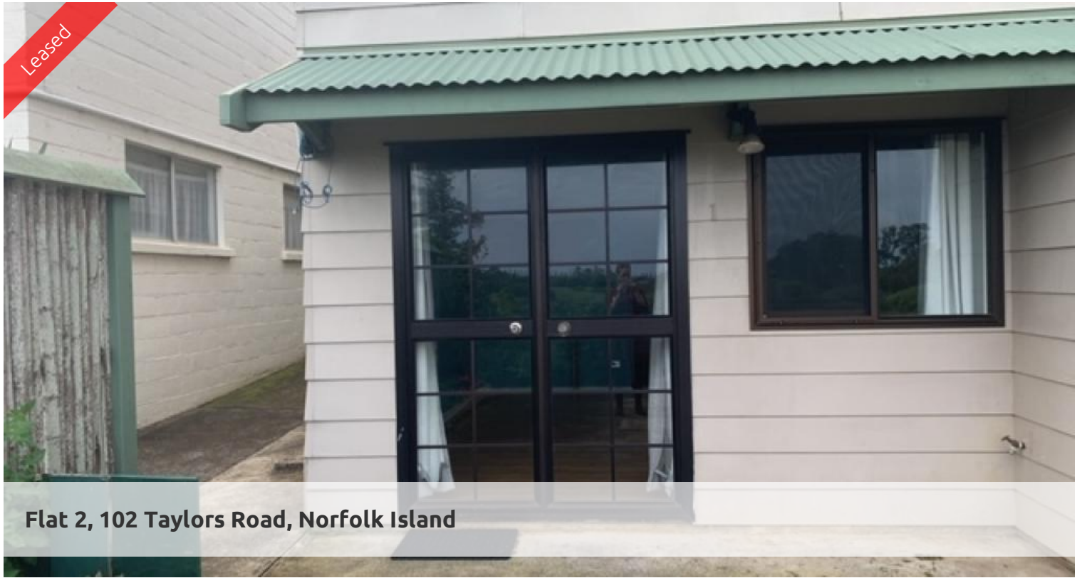
Flat 2, 102 Taylors Road, Norfolk Island