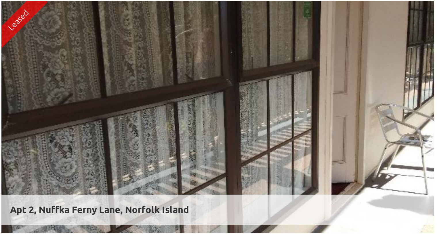
Apt 2, Nuffka Ferny Lane, Norfolk Island