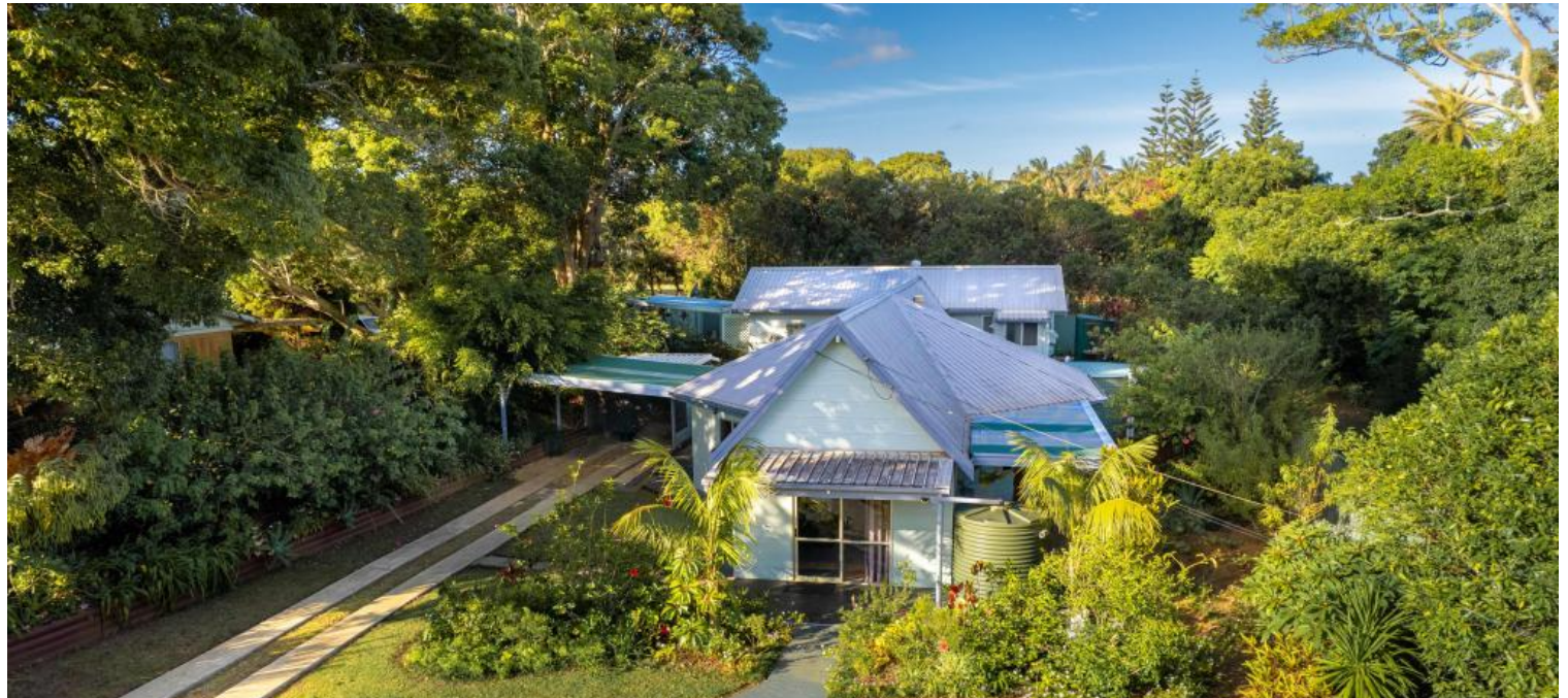
22 Grassy Rd, Norfolk Island